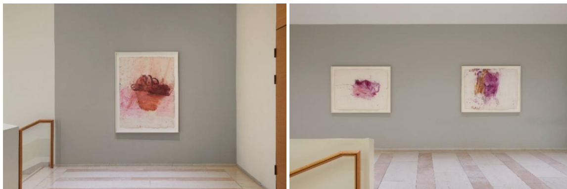
© Martha Jungwirth / Bildrecht, Vienna 2024. Courtesy of Galerie Thaddaeus Ropac, London · Paris · Salzburg · Seoul. Photo: Ulrich Ghezzi.

For the design of the 2024 annual programme , the Salzburg Festival was able to use works by one of the most important artist of our times, Martha Jungwirth . During the Festival period, the Salzburg Festival cooperated with the Galerie Thaddaeus Ropac to show works from the series Odyssey by Martha Jungwirth inside the Festspielhaus foyer.