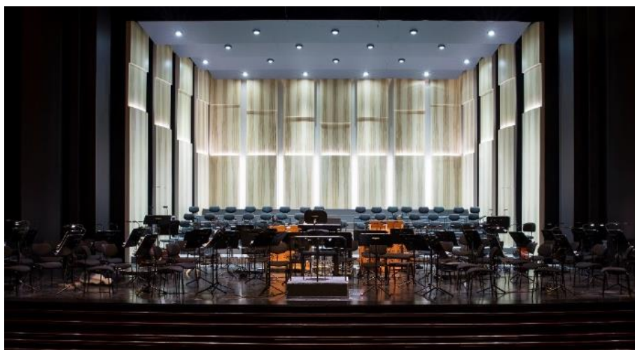
The new concert shell at the Haus für Mozart, planned and built by the Festival's own workshops

The construction of a new concert shell has significantly improved the performance conditions at the Haus für Mozart. Planned and built by the Festival's own workshops, the new "concert room" consists of two side walls, a rear wall and a ceiling and is custom-made for the Haus für Mozart, fulfilling higher acoustic, technical and aesthetic standards.